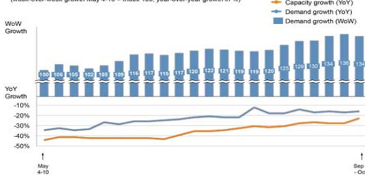
Global air cargo volumes and capacity developments (week-over-week growth May 4-10 = Index 100, year-over-year growth in %)

Forwarders, who were talking about a peak season, but were unable to experience a clear increase in demand, have seen a rise in air freight prices. In particular, as the supply has not increased anymore, e-commerce and high-tech product launches and demand for general retail imports are concentrated, gradually showing a typical